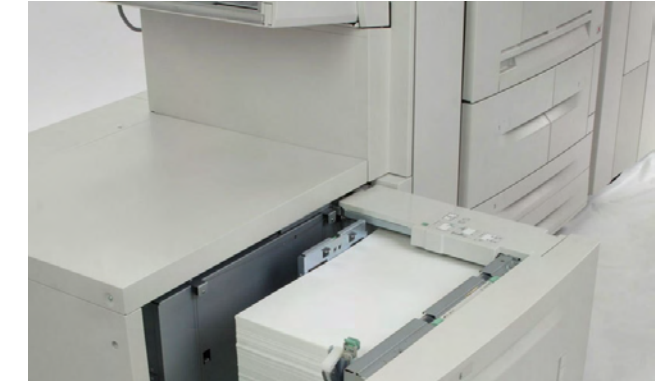
Media / Feeding / Finishing